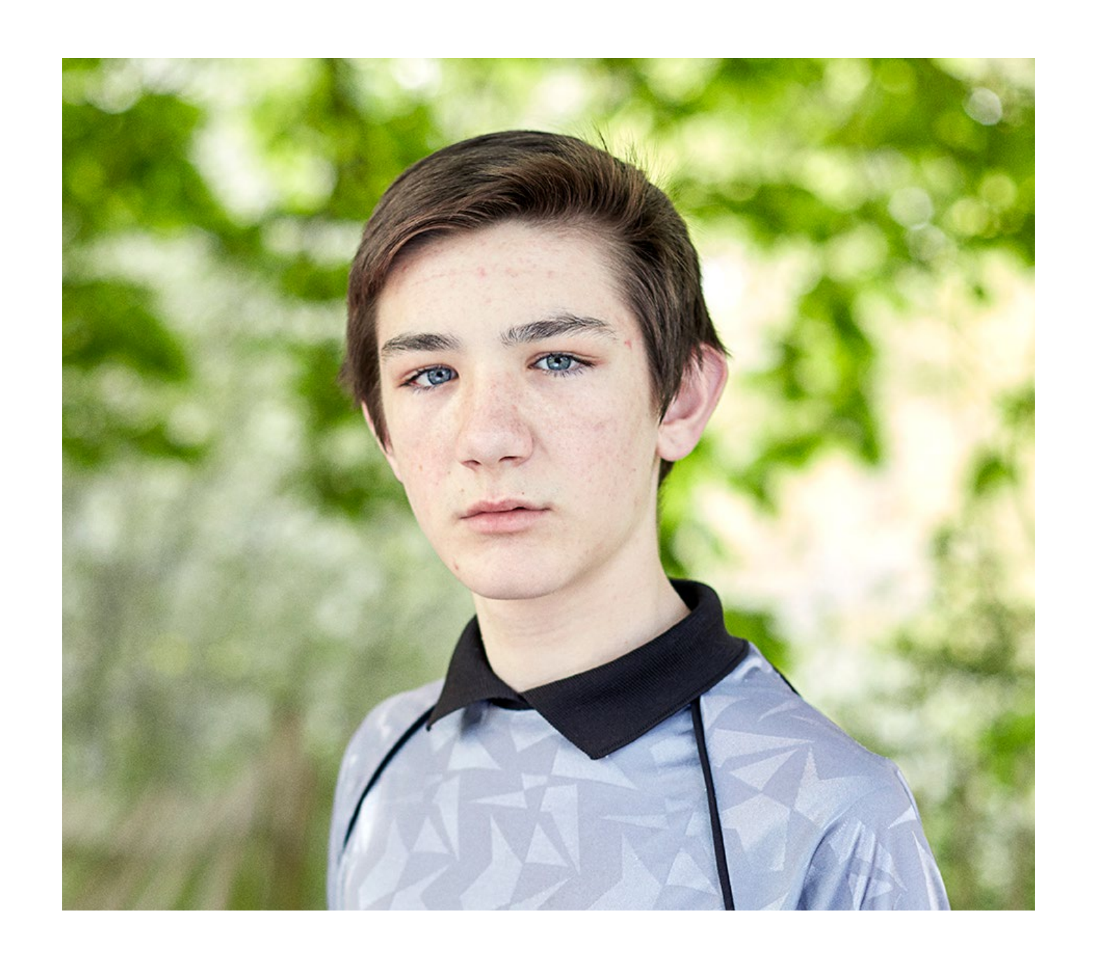
Summary and conclusion